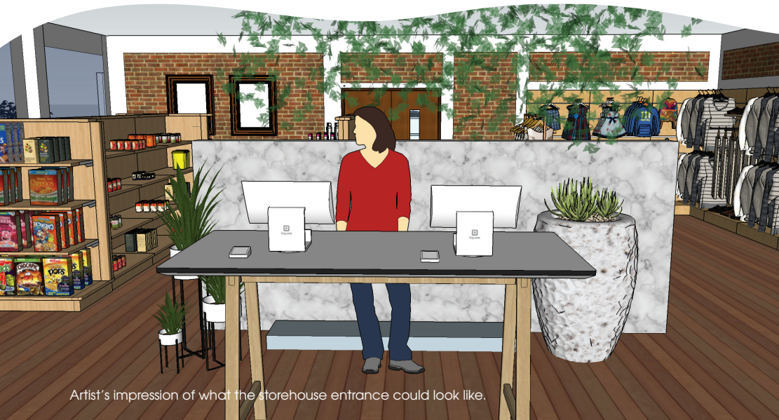
Artist's impression of what the storehouse entrance could look like.

Very simply, we believe the time to do this is now!!